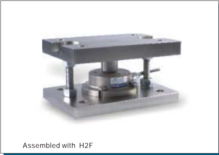
Assembled with H2F