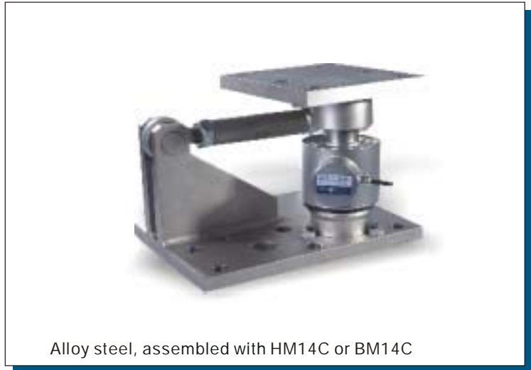
Alloy steel, assembled with HM14C or BM14C