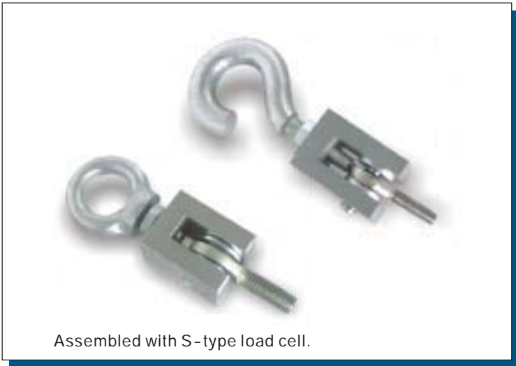
Assembled with S-type load cell.