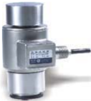
Assembled with BM14A, stainless steel, Anti-rotate with M8 screw hole.