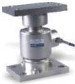
Alloy steel, assembled with HM14C or BM14C.

Capacity Part number 10t-50t HM-14-403-10/50t